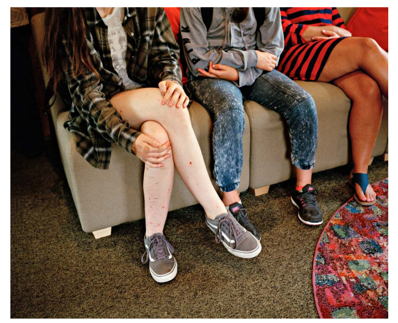
Kids hanging out in the lounge after lunch at Mountain Valley.

She pointed to the increasing use of "504 plans," a popular educational tool that allows for academic accommodations for students with physical or mental disabilities. Though 504 plans for anxiety vary by student, a typical one might allow a teenager to take more time on homework and tests, enter the school through a back door — to avoid the chaos of the main entrance — and leave a classroom when feeling anxious.