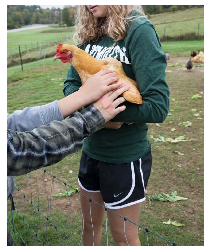
Teenagers at the chicken coop at Mountain Valley.