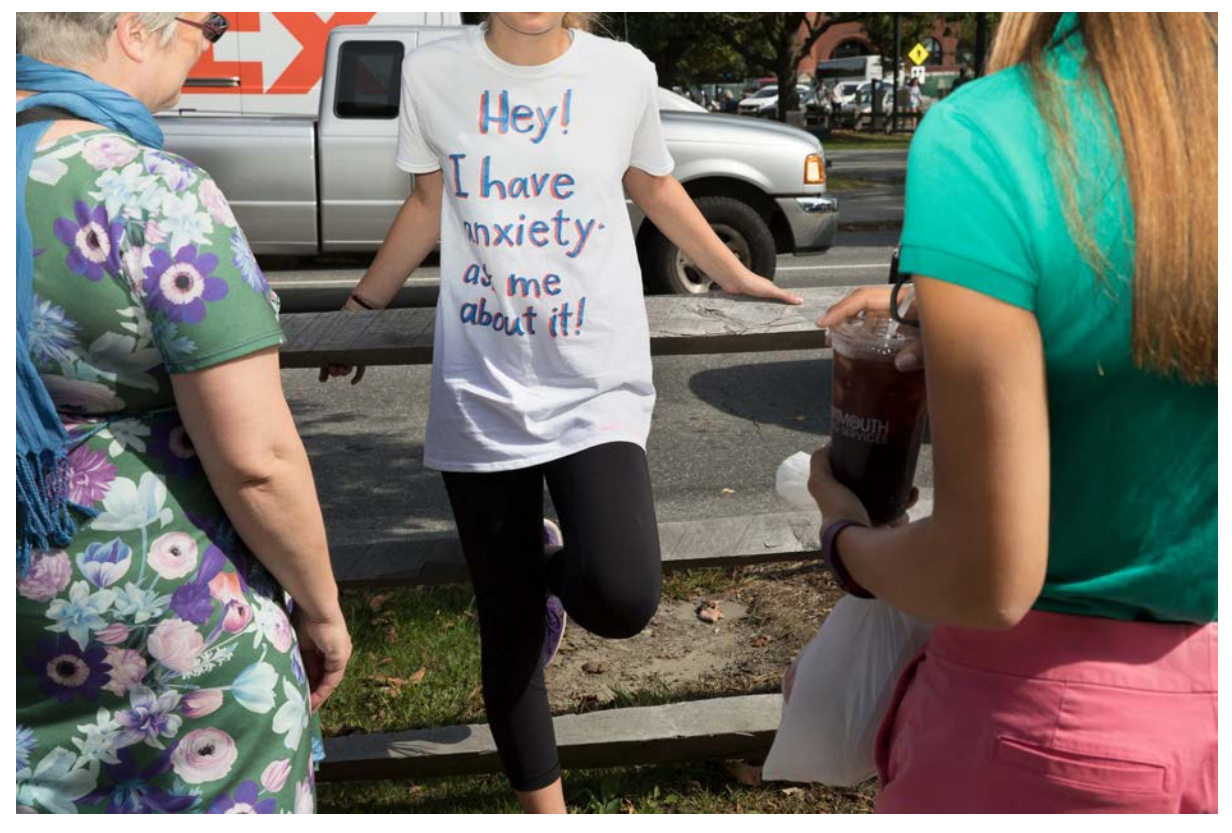
A Mountain Valley teenager talking to a passer-by during exposure therapy.

On a busy weekday morning last May, a new crop of Mountain Valley residents were discovering that a key component of their treatment would involve repeatedly making fools of themselves. On the Dartmouth College campus, eight teenagers wore handpainted white T-shirts that read "Ask Me About My Anxiety" and "I Have OCD." They were encouraged by the therapy team to come up with scenarios that would make them uncomfortable. One teenager considered approaching random guys on campus and saying, "You must be a Dartmouth football player." Later that afternoon, a second group of teenagers arrived. One feigned a panic attack at Starbucks. Another ordered nonsensically at a restaurant.