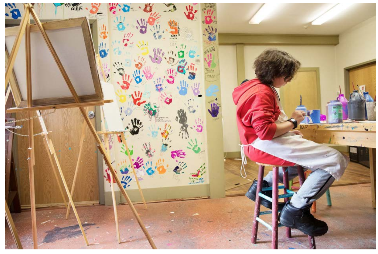
A Mountain Valley resident doing art therapy.

Some schools have taken drastic measures to accommodate what one administrator called "our more fragile students." At Roxbury High School in Roxbury Township, N.J., there are two dedicated classrooms for anxious teenagers, including one next to a mural of Edvard Munch's painting "The Scream." These students typically avoid the mammoth school cafeteria in favor of eating lunch in one of the classrooms, as they did on the day of my visit last May. They had just finished gym class, an anxiety-producing event for some even as the school did all it could to reimagine the concept. Music blasted throughout the gym as the teenagers halfheartedly played something vaguely approximating a game of volleyball. The ball was allowed to bounce once before being struck — not that anyone was keeping score.